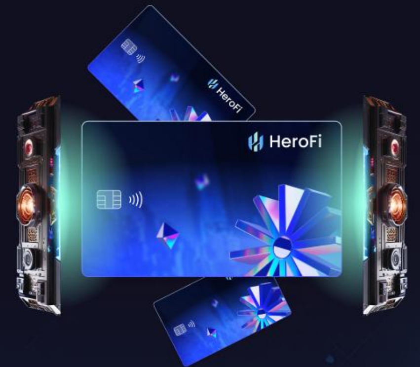
Crypto Debit Card