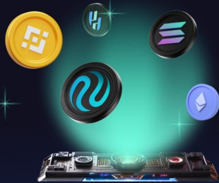
HeroDEX - Trading Platform & Automated Investments